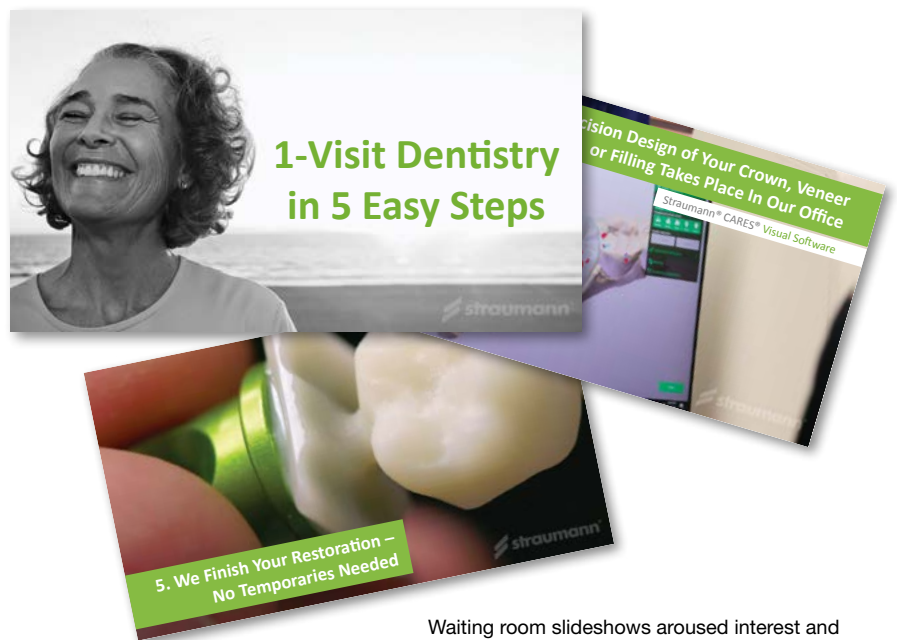
Waiting room slideshows aroused interest and helped “script” conversations with patients.

The cost-efficient synergies of the CARES® videos, eBook and marketing materials paid dividends quickly, generating more than 375 qualified leads within the first phase of the program. Amazingly, Creative Co-op’s campaign brought in new prospects for less than one-tenth the cost of an earlier CARES® campaign – making it a huge hit for Straumann.