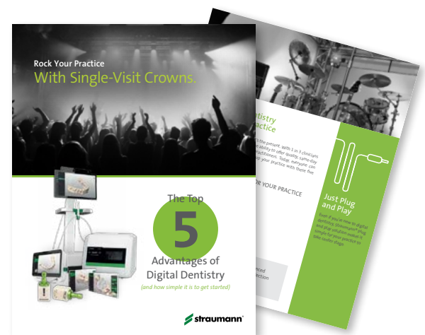
An informative eBook shared big-picture insights on digital dentistry and explained the CARES® system in depth.