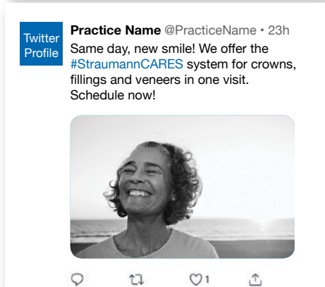
Ready-made social media posts made it easy for dentists to use CARES® as a competitive edge.