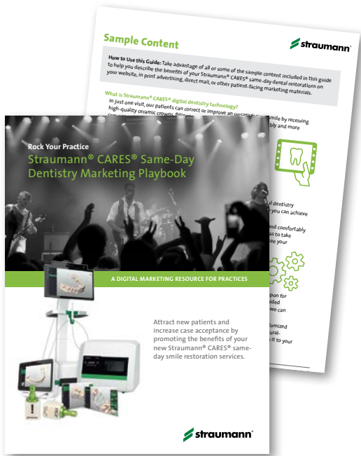
A marketing playbook offered co-branded tools to help practices promote themselves.