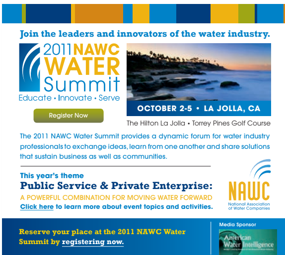
Online Water Summit Invitation

Communicating consistently across multiple channels grew the impact and reach of the NAWC message, giving it greater industry prominence and credibility. The branding established by Creative Co-op remains a key part of the organization's marketing communications.