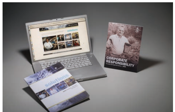
Print Collateral and Integrated Marketing Materials